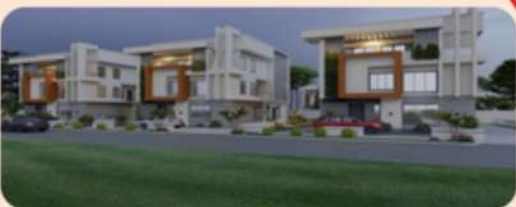
PEACHVILLE GARDENS 5 BEDROOM FULLY DETACHED DUPLEX Project Status: ON-GOING