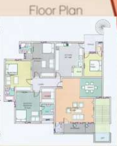
PEACHVILLE APARTMENTS GUZAPE Project Status: COMPLETED