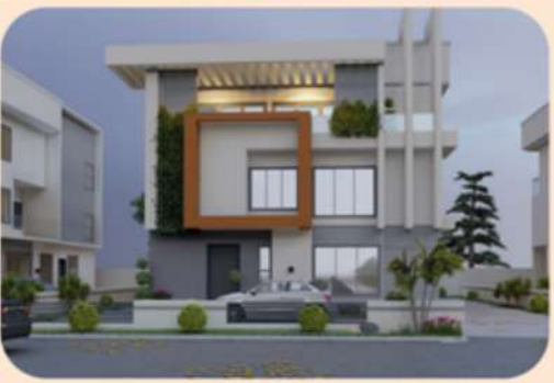
PEACHVILLE GARDENS 4 BEDROOM TERRACE DUPLEX Project Status: ON-GOING